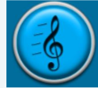
Mobile Sheets (Windows)